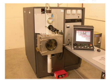
State of the art CNC Electron Beam Welder Model 512 Beamer Chamber 12x12x12 Weld Penetration in streel .025 mm to 18.0 mm

Weld times from 0.1sec to 999sec Speed 760 mm per